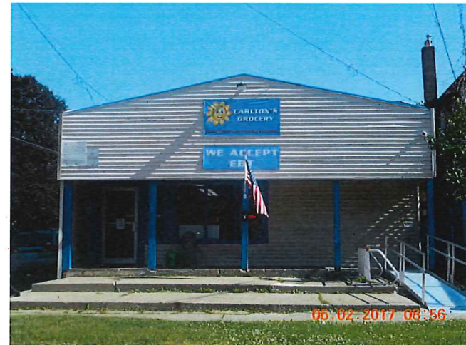
Post-Franklin Neighborhood Planning Council